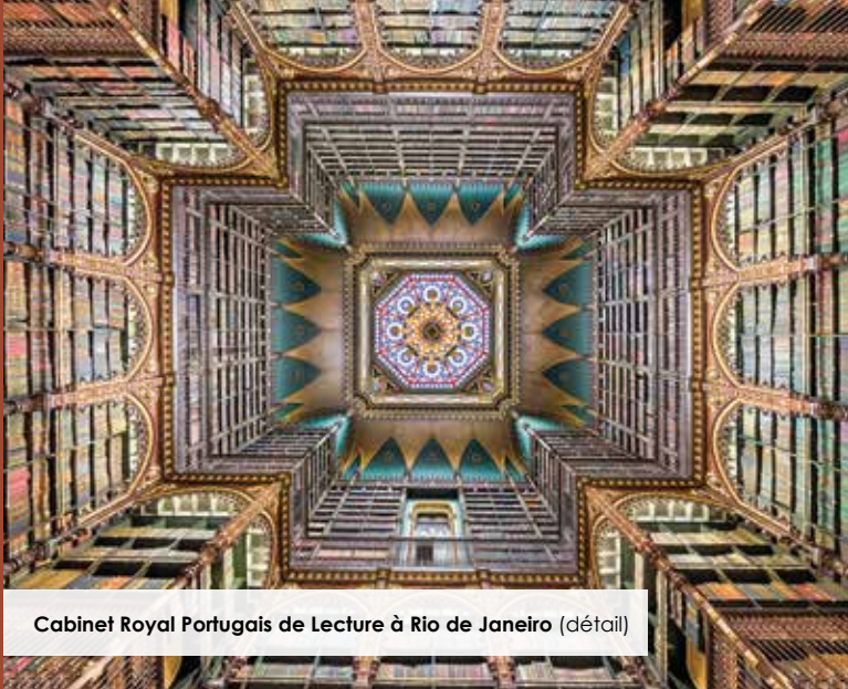
Cabinet Royal Portugais de Lecture à Rio de Janeiro (détail)