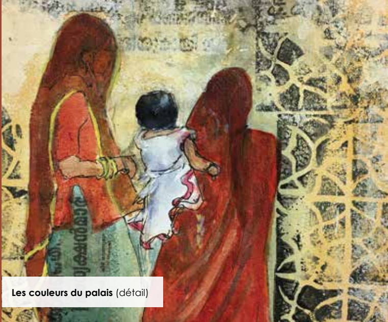
Les couleurs du palais (détail)

May 10 to June 29 Espace Mur-mur des arts