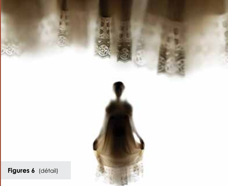
Figures 6 (détail)