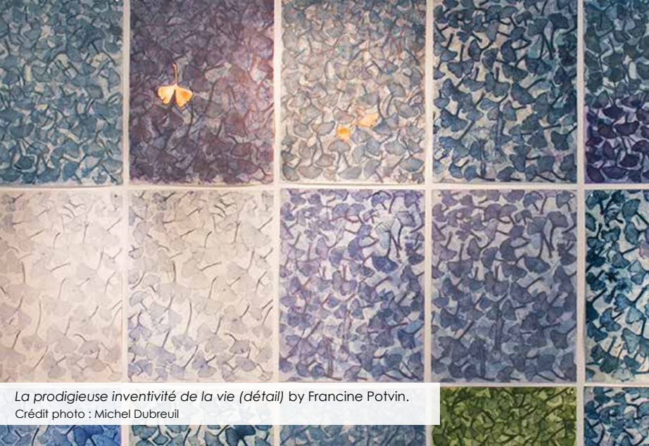
La prodigieuse inventivité de la vie (détail) by Francine Potvin.