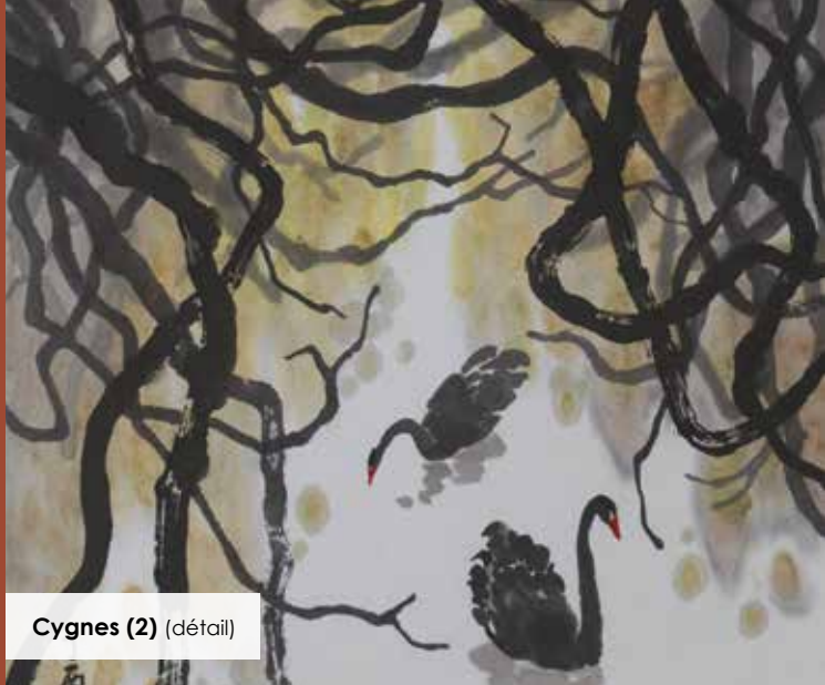
Cygnes (2) (détail)